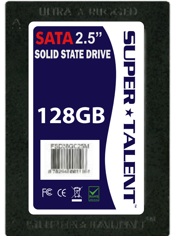
Designed and Manufactured in USA